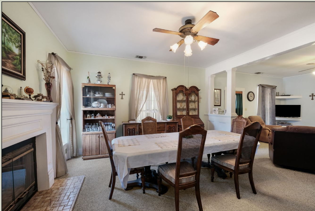
Gruber Ranch Sales | 235 19 th Street, Ste 101, Hondo, Texas 78861