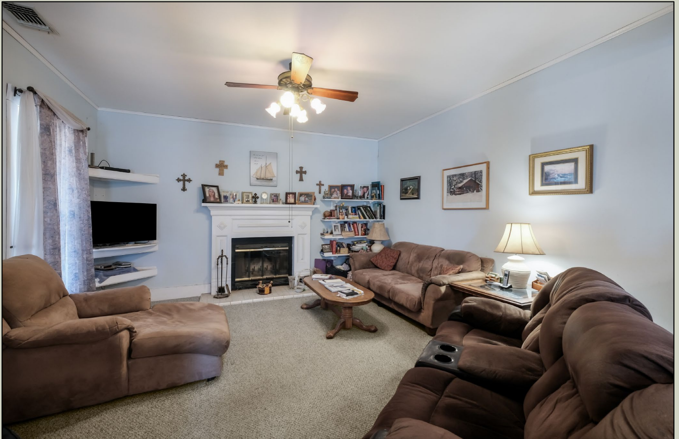
Gruber Ranch Sales | 235 19 th Street, Ste 101, Hondo, Texas 78861