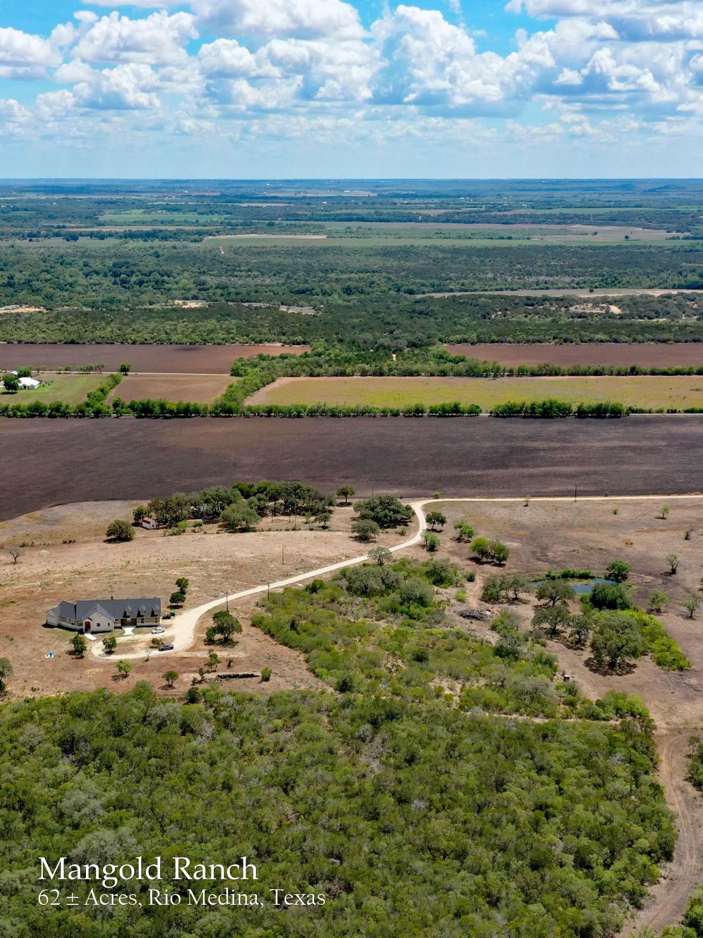
Mangold Ranch 62 ± Acres, Rio Medina, Texas